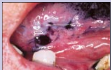
Figure 11. Leukoplakia after toluidine blue staining.

self-mutilation is seen in psychiatric disorders, mental handicap or some rare syndromes.