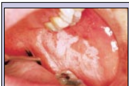
Figure 7. Homogeneous leukoplakia.