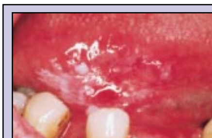
Figure 10. Leukoplakia before toluidine blue staining.