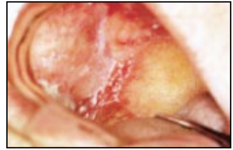
Figure 16. Speckled leukoplakia .

The oral mucosa is mainly affected. Tight vertical bands in buccal mucosa (or palate or tongue) may progress to