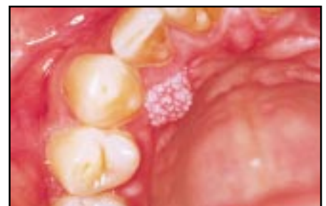
Figure 6. Papilloma.

Syphilitic leukoplakias have no distinctive features, but typically affect the dorsum of the tongue and spare the margins. Lesions have an irregular outline and surface, and are usually regarded as having a high risk of malignant change and cracks. Carcinoma developing near the centre of the dorsum