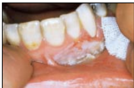
Figure 17. Burn caused by aspirin.