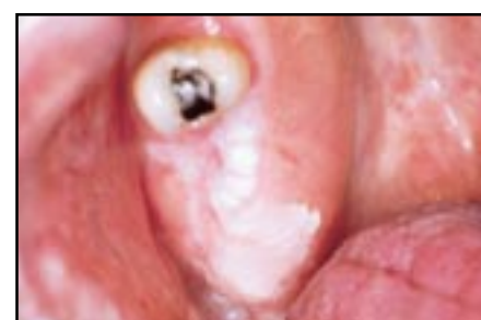
Figure 12. Frictional keratosis.

Figure 14 shows a stomatitic lesion caused by exposure to tobacco. Smoker's keratosis will be discussed in detail in a later article. Snuff dippers' keratosis and other smokeless tobacco lesions are described here.