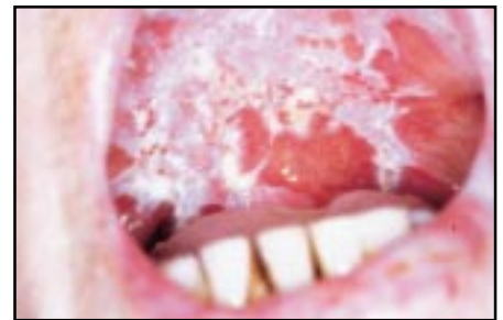
Figure 5. Candidal leukoplakia.

Condylomata (genital warts) are usually seen on the tongue or fauces in sexually active persons.