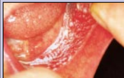
Figure 9. Speckled leukoplakia.