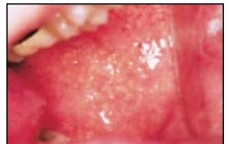
Figure 1. Fordyce's spots.

White sponge naevus is usually diagnosed from the clinical features; biopsy is confirmatory but rarely indicated. No reliable treatment, other than reassurance