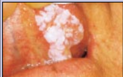
Figure 8. Verrucous leukoplakia.