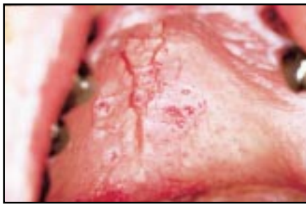
Figure 14. Stomatitis nicotina .