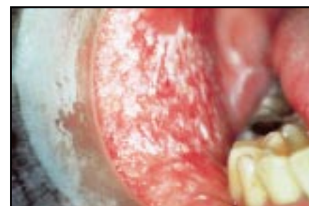
Figure 13. Frictional keratosis.

frequently in severely dysplastic lesions. Because of the rarity of dysplastic oral lesions only a few studies, all on a small scale, have followed their progress for adequate periods. In a study of 45 patients with oral dysplastic lesions followed for up to 8 years, about 11% underwent malignant change in this period but up to 30% of them regressed or even disappeared spontaneously. It is therefore not possible to prognosticate solely on the basis of the histopathological changes. The histological assessment of oral epithelial dysplasia is also notoriously unreliable; in one study, pathologists in nearly 20% of cases could not confirm their own earlier diagnoses of dysplasia or its absence. An additional (and serious) problem is that, apart from the subjective nature of the histological assessment, there is no certainty that any biopsy specimen is representative of the whole lesion.