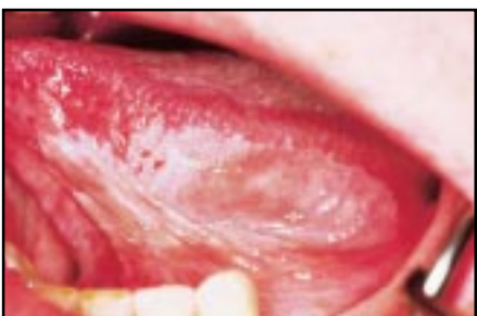
Figure 15. Sublingual keratosis .

The aetiology for this condition is unknown.