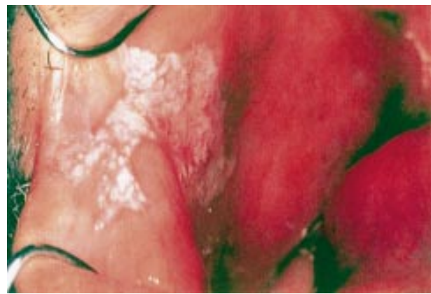
Figure 3 Chronic hyperplastic candidiasis.

Chronic atrophic candidiasis also known as "denture stomatitis" is characterised by localised chronic erythema of tissues covered by dentures. Lesions usually occur on the palate and upper jaw but may also affect mandibular tissue. Diagnosis requires removal of dentures and careful inspection; swabs may be taken for confirmation. It is quite common with incidence rates of up to 65% reported.