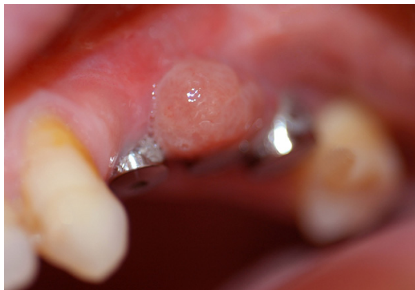
FIGURE 1. Erythematous ulcerated nodule located on buccal aspect of implant in the upper left second premolar position.

Dojcinovic, Richter, and Lombardi. Pyogenic Granuloma and Dental Implant. J Oral Maxillofac Surg 2010.