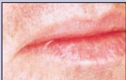
Figure 2. Actinic cheilitis.