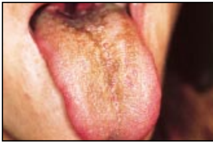
Figure 4. Black hairy tongue.