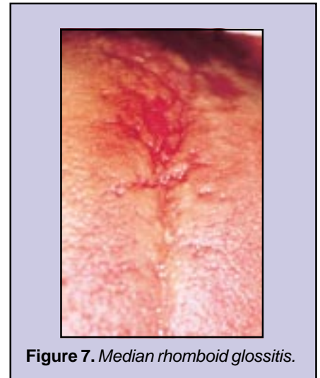
Figure 7. Median rhomboid glossitis.