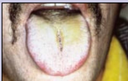
Figure 3. Furred tongue.

without dentures, unilateral cases and patients in whom there are other lesions such as ulcers or glossitis.