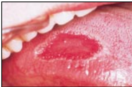
Figure 6. Geographic tongue.

carcinoma, granular cell tumour (granular cell myoblastoma), Kaposi's sarcoma.