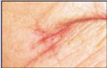
Figure 1. Angular cheilitis (bilateral angular stomatitis).