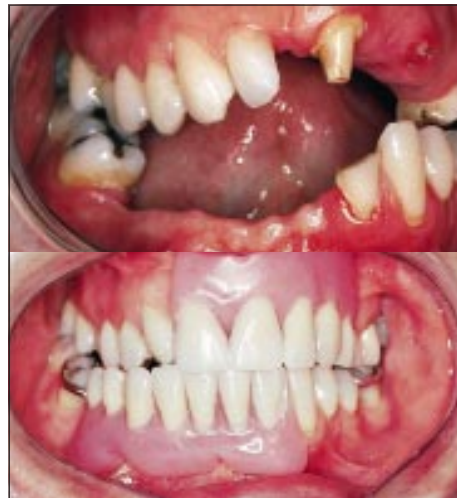
Tooth damage by trauma (top) and appearance after restoration (bottom)