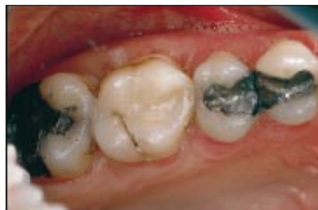
Dental amalgams and a composite restoration in molars to treat caries