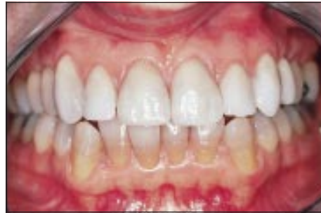
Porcelain veneers to treat tetracycline staining of upper teeth (appearance of lower teeth was deemed acceptable)