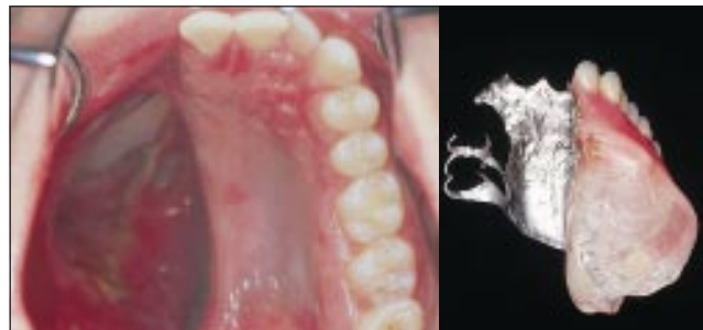
Patient with palatal defect (left) and obturator made to separate oral and nasal cavities (right)