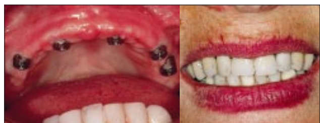
Patient with implants inserted surgically into alveolar bone of edentulous maxilla (left) to stabilise fixed bridge (right)