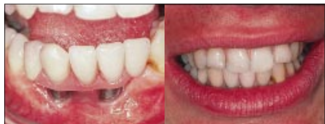
Patient with missing teeth and jaw bone after road traffic accident: temporary appliance on dental implants (left) and definitive prosthesis in place (right)