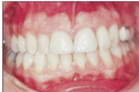
Conventional crown on maxillary left central incisor