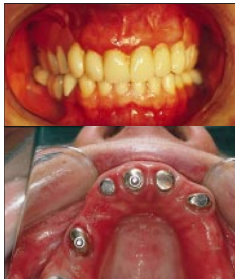
Overdenture (top) supported by metal studs inserted into natural tooth roots (bottom)