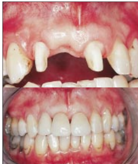
Conventional bridgework in patient with missing incisor: neighbouring teeth are ground down to take artificial crowns (top) and final result (bottom)