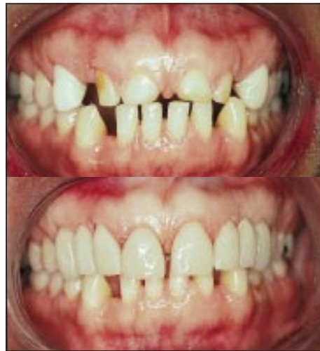
Patient with badly worn and spaced teeth (top) and appearance after restoration (bottom)

Amalgam has physical properties superior to tooth coloured materials, the only reasonable alternatives. It is the most cost effective restorative material, with an average life span of about five years, although some fillings last 20 years or more. Amalgam has been used for over 170 years. Nevertheless, because of the health concerns the UK Department of Health has recently advised that amalgams should not be placed in pregnant women. After assessment of the potential risks of undergoing dental treatment during pregnancy, it can be stated