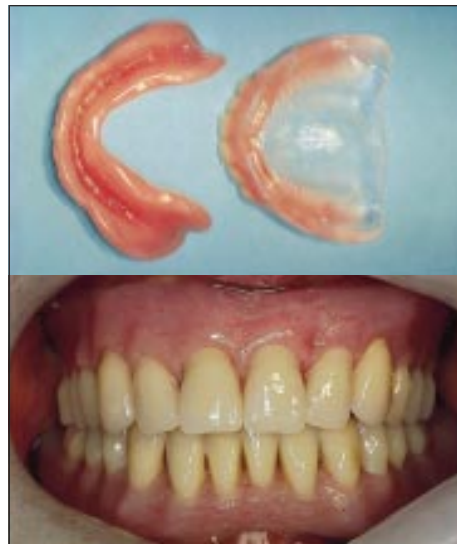
Complete lower and upper dentures (top) and their appearance in situ (bottom)

Resin bonded bridgework is secured to the teeth with adhesive composite resin materials. It is indicated when the teeth are relatively unrestored. The main advantage is that little