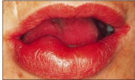
Mucocele in a typical site

Management —Diagnosis is mainly clinical, but investigations such as serology for autoantibodies or HIV antibodies, liver function tests, and needle or open biopsy may be indicated. Treatment is of the underlying cause.