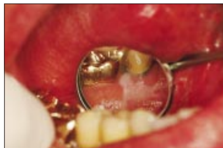
Leucoplakia of lower gingivae—a typical site for this type of lesion