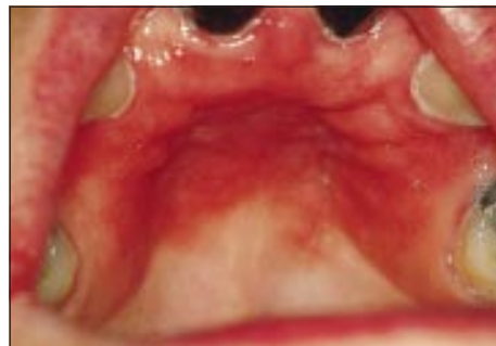
Chronic atrophic candidiasis beneath an upper denture