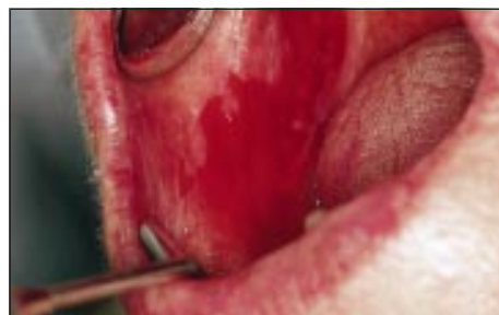
Erythroplasia has high malignant potential