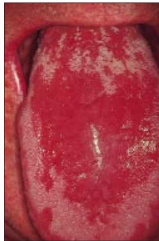
Erythematous candidiasis in patient with HIV infection

This is a persistent adherent white patch. Keratoses are most commonly uniformly white plaques (homogenous leucoplakia), prevalent in the buccal mucosae, and are usually of low malignant potential. More serious are non-homogenous keratoses (nodular and, especially, speckled leucoplakias), which consist of white patches or nodules often in a red, commonly eroded, area of mucosa. The presence of severe epithelial dysplasia indicates a considerable risk of malignant development. The overall prevalence of malignant change is