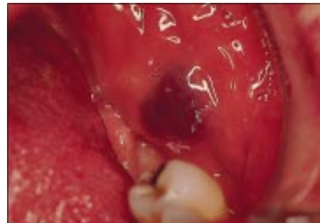
Haemangioma of left buccal mucosa. Unlike Kaposi's sarcoma, this lesion blanches on pressure

This is usually racial in origin or caused by smoking or betel use and only occasionally has a systemic cause such as drugs, Addison's disease, or ectopic production of adrenocorticotrophic hormone (such as by bronchogenic carcinoma).