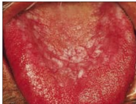
Lichen planus of dorsum of tongue