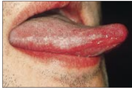
Hairy leucoplakia on lateral margin of tongue of patient with AIDS

Treatment is usually not required, but it resolves with aciclovir or anti-retroviral agents.